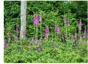
Photo 3 is a photography for fun group, we meet twice a month on the 2 nd and 4 th Tuesday afternoons. Going out to take photos on one meeting and reviewing the photos at the next meeting.